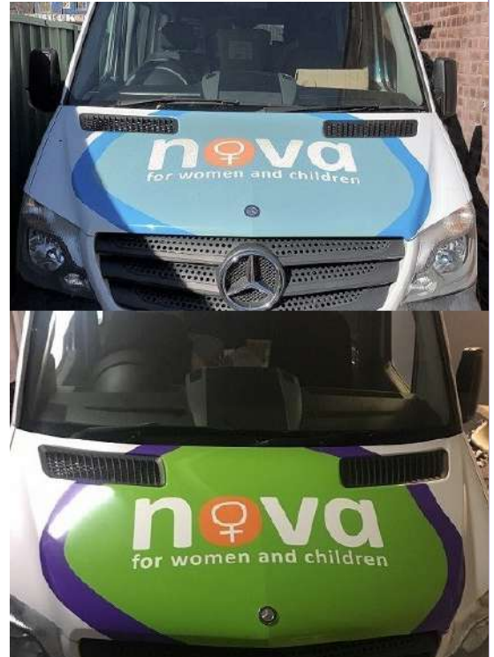
'Betty's makeover - before (top) & after (below) See more pics on our Facebook page

'This project received grant funding from the Australian Government'